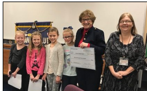
K-Kids Officers present check to Piqua City Library during Kiwanis meeting. Money raise through December Read-A-Thon