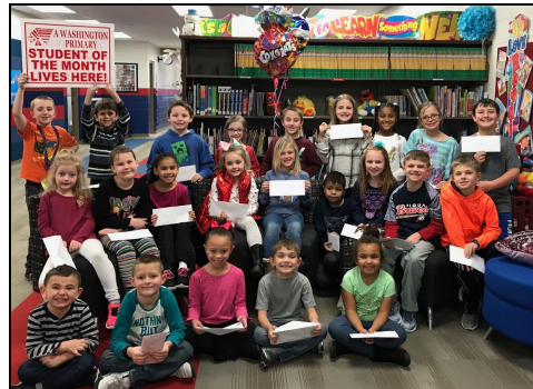
January Students of the Month