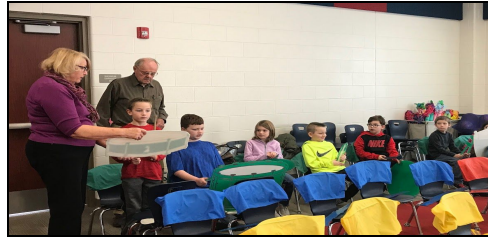
2nd Graders - Orchestra & You